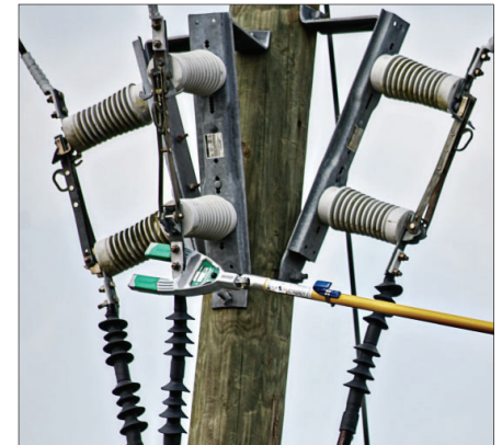
Standard Ampstik+ on Overhead Switch