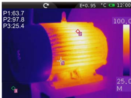
Up to 3 measurement Spots