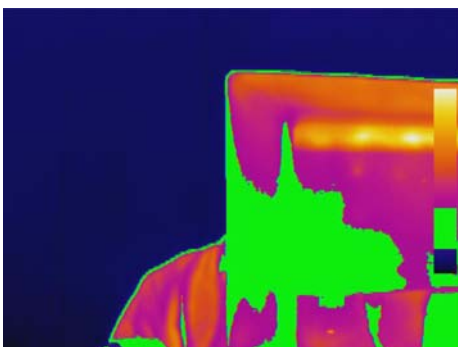
Advanced analysis: Isotherm feature