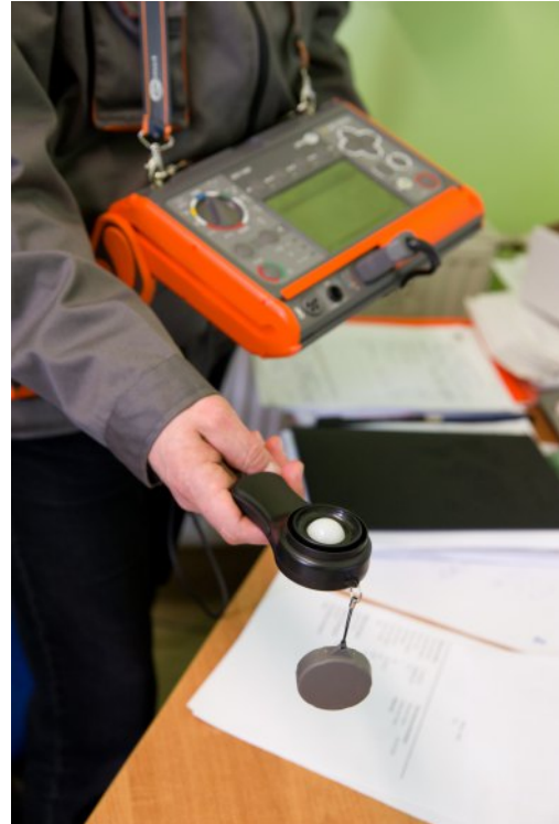
Photo. Illuminance measurement.

- measurement in luxes (lx) or feet-candles (fc)