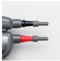
Push-on probe tips (limiters) 4 mm